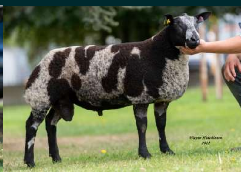
9,000gns Freaky Freddie from E & A Shortt