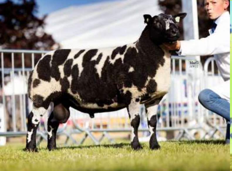
Breed Reserve Champion, Royal Highland Show Import Dutchman