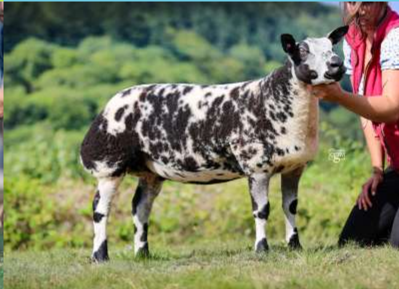
JDR & JL Corbett bred Wedderburn Flirty, who sold for 18,000gns at Welshpool