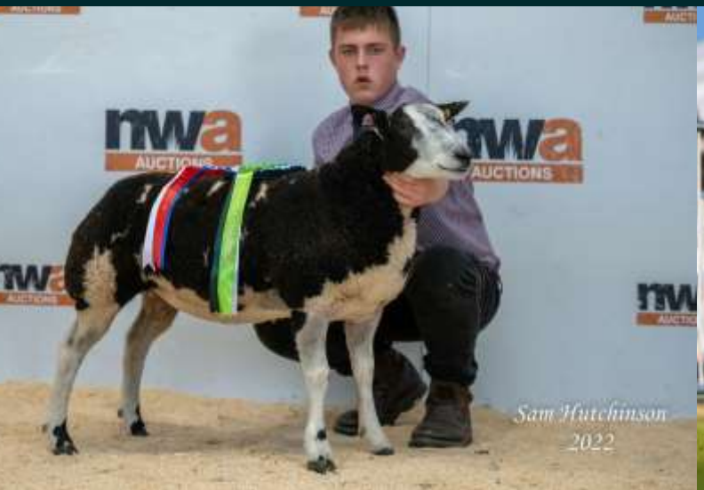
Breed Champion, J36 Show and Sale C View Fiesta