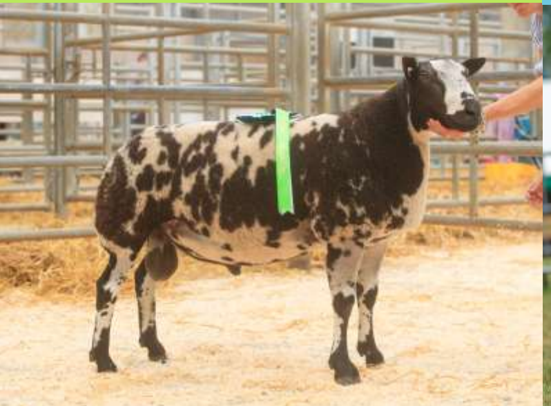
Breed Champion, Melton Mowbray Show & Sale Williams Extreme, sold for 700gns