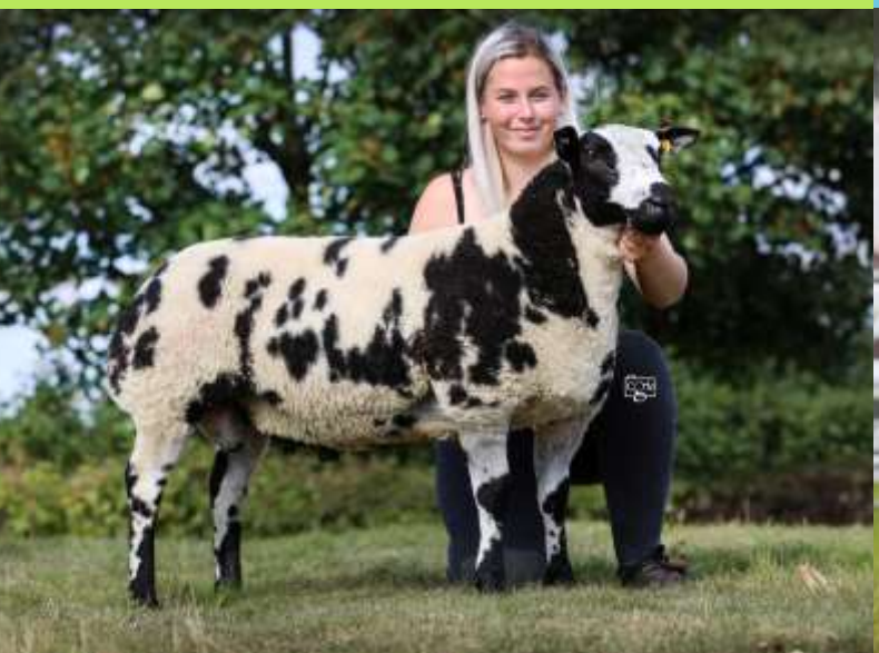
Breed Champion, Worcester Show & Sale Tiptop Final Destination