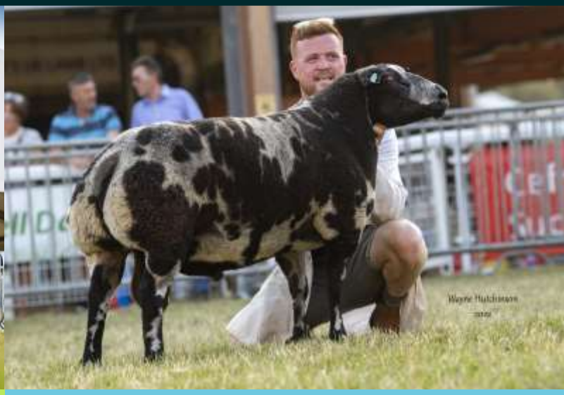
Breed Champion, Royal Welsh Show Tiptop Charlie