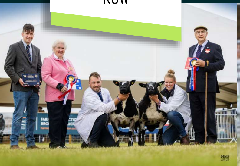
Interbreed Pairs Champions, Royal Highland Show Tiptop Diana & Import Dutchman