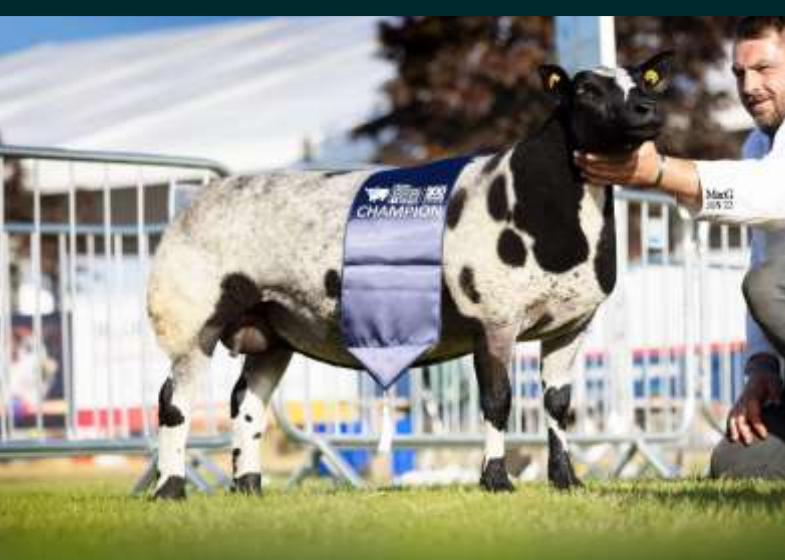
Breed Champion, Royal Highland Show Tiptop Diana