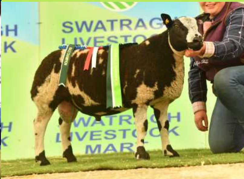
Breed Champion, Swatragh Show & Sale Diamond Fearless