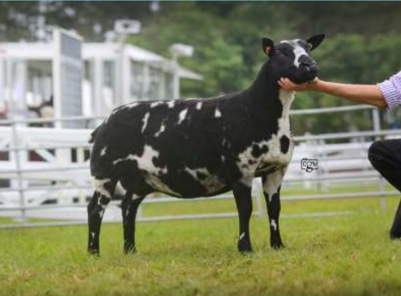
Breed Champion, Royal Cornwall Show Aged Ewe, Crayola