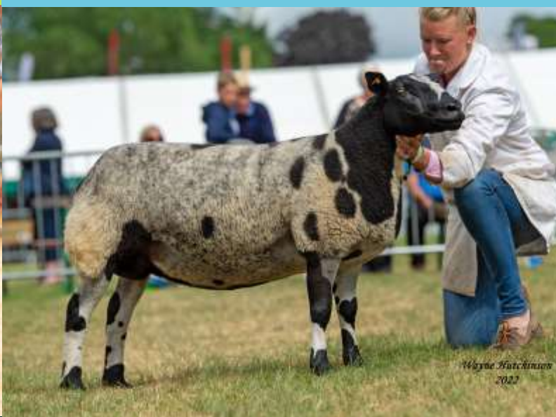
Breed Champion, Great Yorkshire Show Tiptop Diana