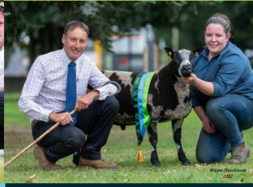
Breed Champion, Carlisle Show & Sale Diamond Fireball - Sold for a record breaking 28,000gns