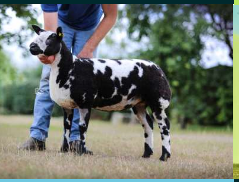
Wedderbrun Flipper, from JDR & JL Corbett sold for 10,000gns at Carlisle Autumn Sale