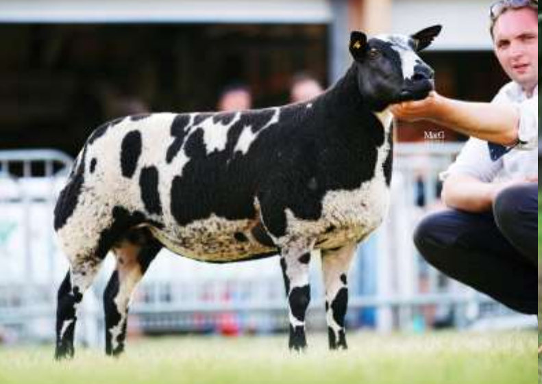
Breed Reserve Champion, Royal Welsh Show Irthing Valley Elderflower