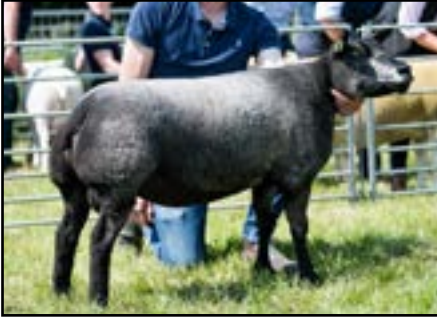
Hodges Gold Dust 2024