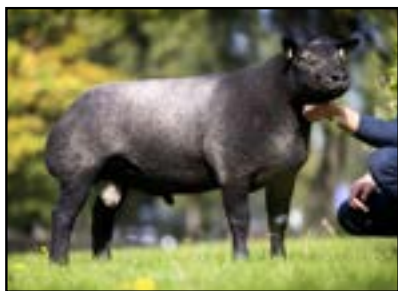
6500gns Hodges Highlander – Top Price Shearling Sold at the Premier sale 2024, Dam Lot (03680) Full Sister Lot (05846)

We would just like to take this opportunity to wish everyone well with their purchases.