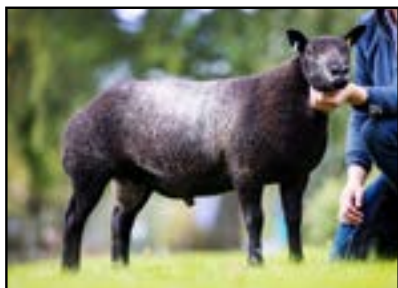
3000gns HODGES JACKPOT Sold at the Premier Sale 2024 Dam Lot (03680)