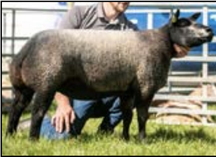
Hodges Gold Dust 2023